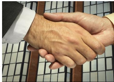
Open lines of communication and productive meetings