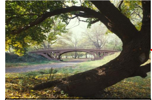
Bridge to our opinion – avoid "but" and "however"