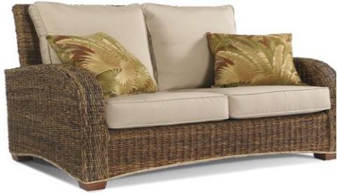
A cushion neither agrees or disagrees – it acknowledges the other person's point of view