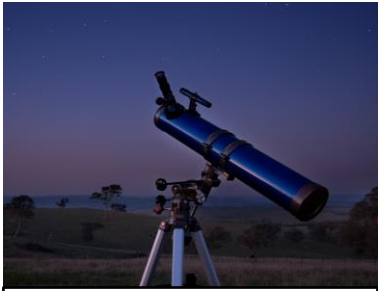
Try honestly to see things from other person's point of view